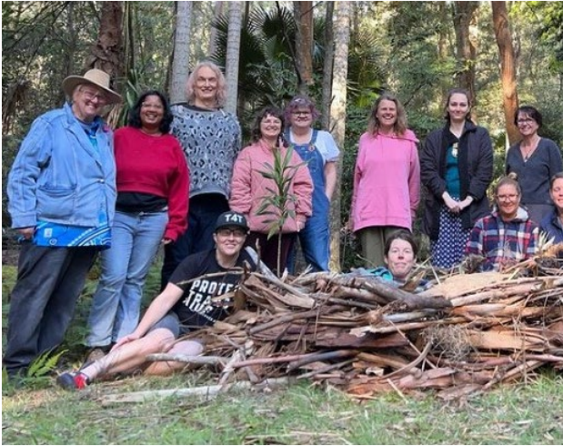
Space Whale Art and Nature Therapy Community Group with their installation “Nest” in PBEAT 2023.