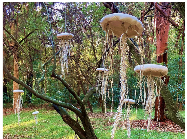
“Tide Rising” by Jojo Fuller. Highly Commended in PBEAT2022 ($1,000).

See also the video at PBEAT2025 | PearlBeachArboretum